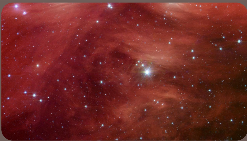
An infrared image of the Pleiades. The Pleiades is the inspiration for the Subaru logo.

Halloween, All Hallows Eve, Samhain. Whatever you choose to call it, this day has astronomical significance. So what does a day of Trick-or-Treating have to do with the stars and planets? If you look to the Eastern Sky in the late October evenings you will see an open cluster of stars,