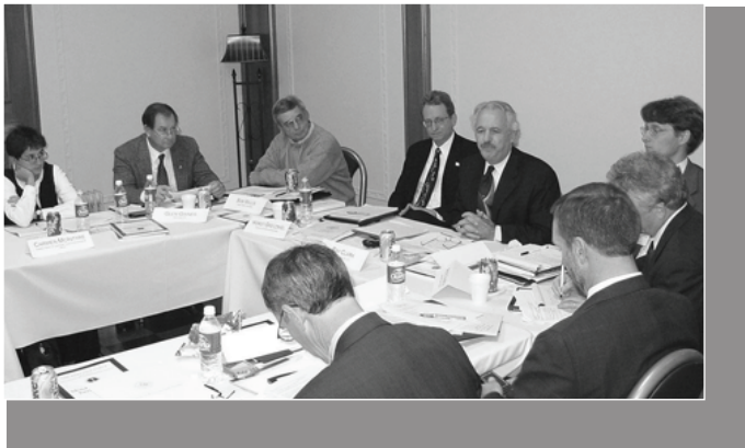
Southern Regional NEPA Roundtable discussion on the NEPA Task Force report Modernizing NEPA Implementation