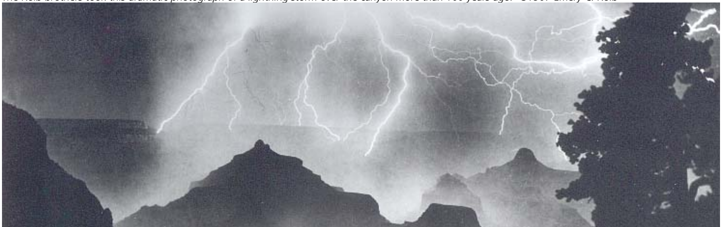
The Kolb brothers took this dramatic photograph of a lightning storm over the canyon more than 100 years ago.